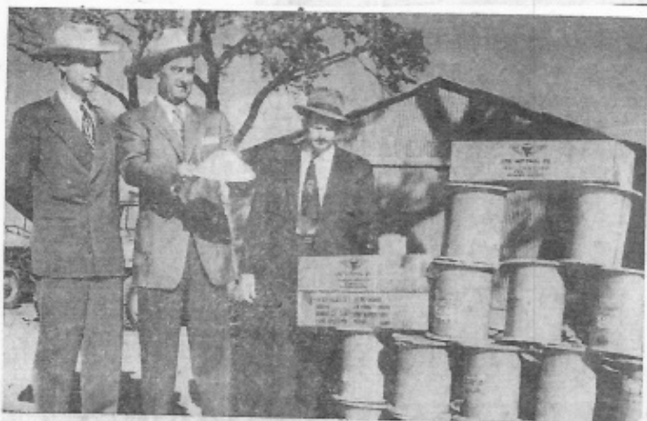
LANDING FIELD LIGHTS for the Gillespie County airport are inspected by County Judge Victor Sagebiel, Senator Lyndon Johnson and Mayor Wm. Schroeder, before the Senator turned them over to the county and city for installation at the Gillespie Airport. They were given by Arthur Godfrey, CBS Radio and Television star, who sent them to his friend, Sen. Johnson, to be turned over to the community.

Heavy traffic has been flowing in and out of the airport during the past several months, with many of the nation's top governmental and political leaders using it for visits to Senator Johnson.